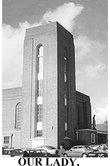
QUEEN OF APOSTLES